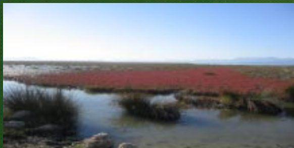
The wetlands of Sagiada, a valuable ecotourism destination in Greece

Contact: Kornel Szelle, e-mail: szelle@axelero.hu, tel.: +36 20 9353223