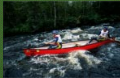
Canoeing in Norrbotten, Sweden

These regions feature rich and diverse natural and cultural resources with varied degrees of tourism development. A range of ecotourism activities are on offer and there is potential for further and more quality-orientated development.